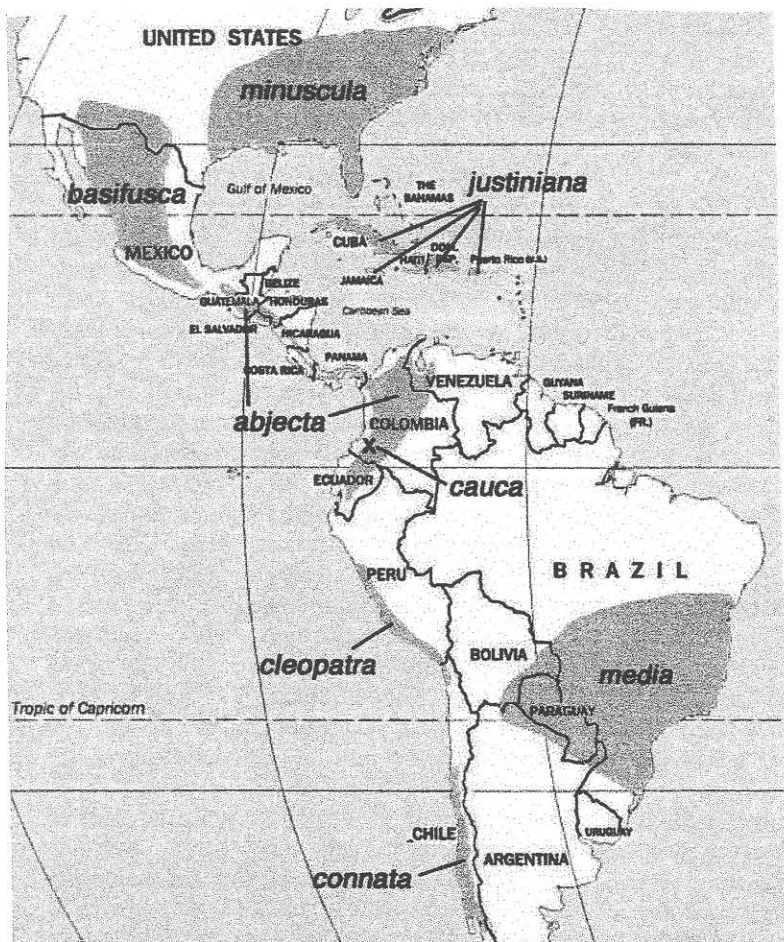
Figure 3. Ranges of some blue-faced species of the Erythrodiplax connata group.

Mexico, at a rain pond at km 49 (4 km S Tehuacán exit) on Oaxaca-Mexico Autopista, 1460 meters, where I took two male fuscus and one male basifusca on 23 September 1999 and saw additional males of each species. At this locality, not only was the difference in frons color obvious, but the two basifusca seen were slightly larger than the half-dozen fuscus seen, with distinctly less dark coloration in the wing base. The three specimens show no sign of intergradation. Additional collecting may bring to light other instances of sympatry of these two species.