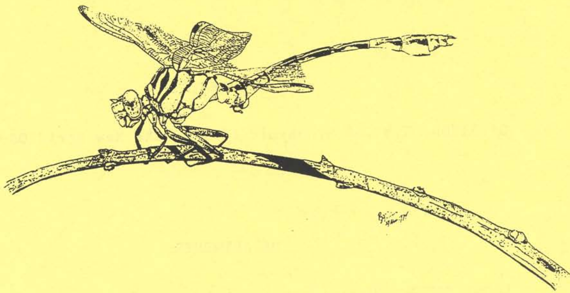
Stylurus plagiatus (Sélys) Yuma, Yuma County, Arizona